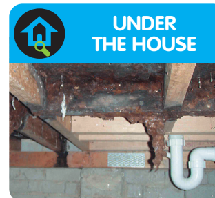
HEALTH & SAFETY ISSUES

Need more information...call 1800 BUY WISE (1800 289 947)