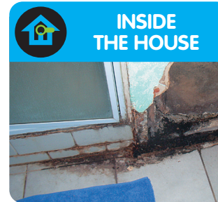
DAMPNESS & MOULD PROBLEMS