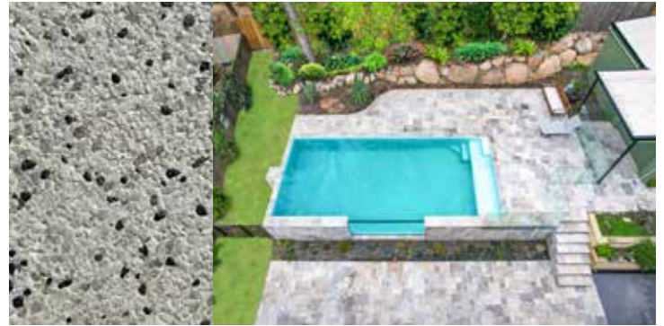
Ecozen Salt & Pepper